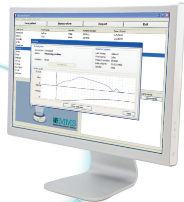
Flowmaster Software running on standard Microsoft Windows® based PC

The Flowmaster is a wireless digital flowmeter designed for practical, everyday flow study investigations, where ease of use, simplicity and cost effectiveness are top priorities.