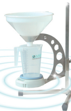
The Luna can be hooked up with a wireless flowmeter using Bluetooth®

The Luna is affordable and weighs less than 200 grams. Ambulatory Urodynamics has never been so easy.