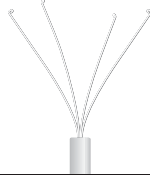
Grasper with Eyelets