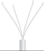
Grasper with Hooks