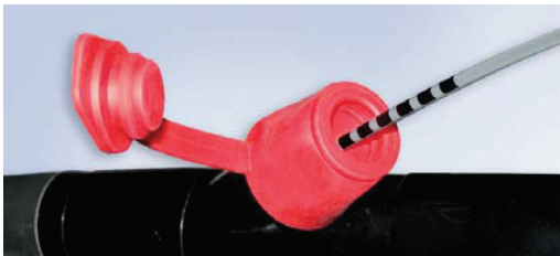
Positioning Bands on the Coating